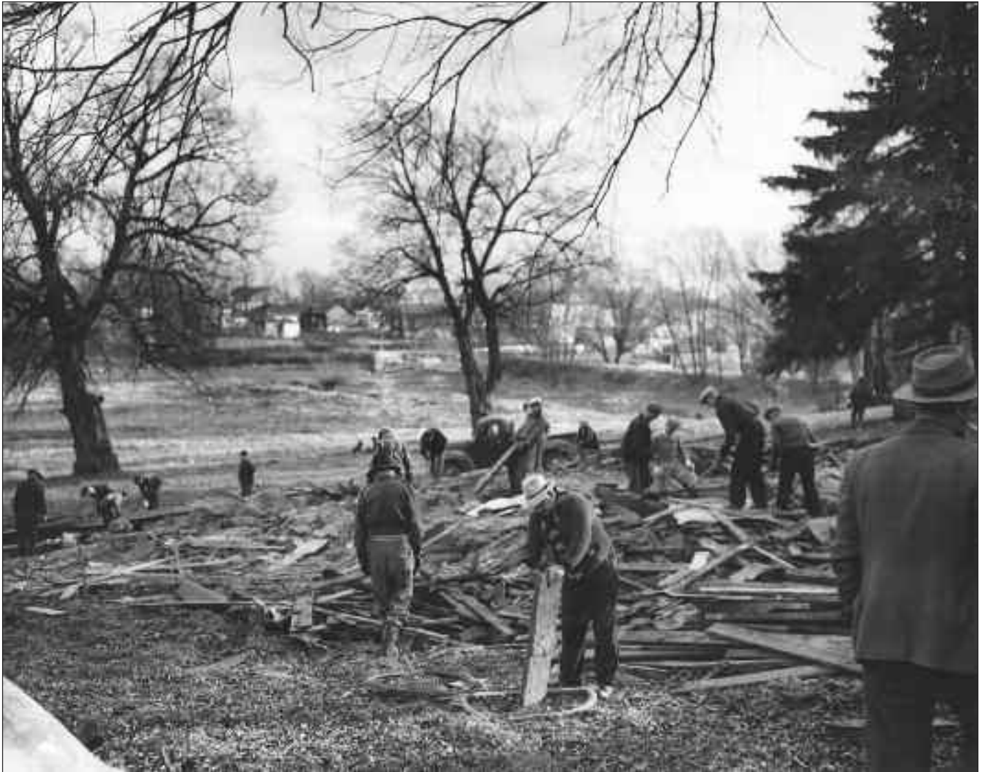
1510 Members of the Mitchell Lions and other volunteers clean up the property on Blenheim Street purchased in 1948 by the club for the purpose of building a community swimming pool. The project was supervised by Lion Dave Eizerman (at extreme right, with back to camera).